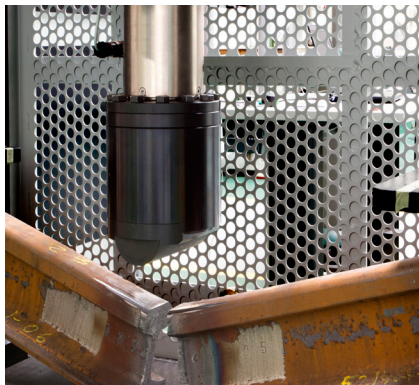
Detail of rail-fracture weld test

Other machine configurations on request.